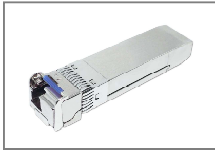
10G SFP+ Bidi LC 1270nm