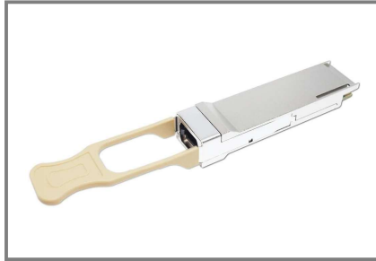
40G QSFP+ MPO SR4